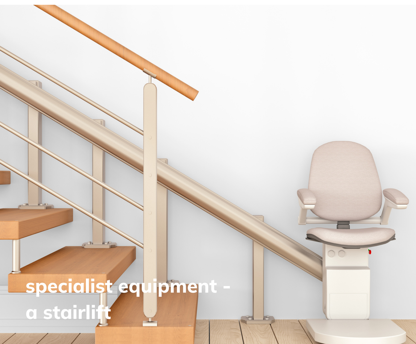
specialist equipment - a stairlift

To make sure this equipment remains safe to use, Golden Lane Housing will regularly inspect and maintain it.