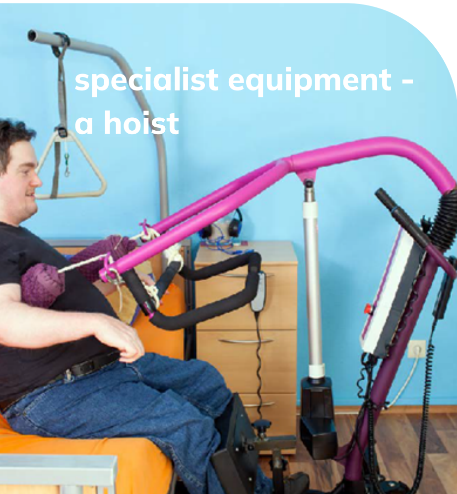
specialist equipment - a hoist