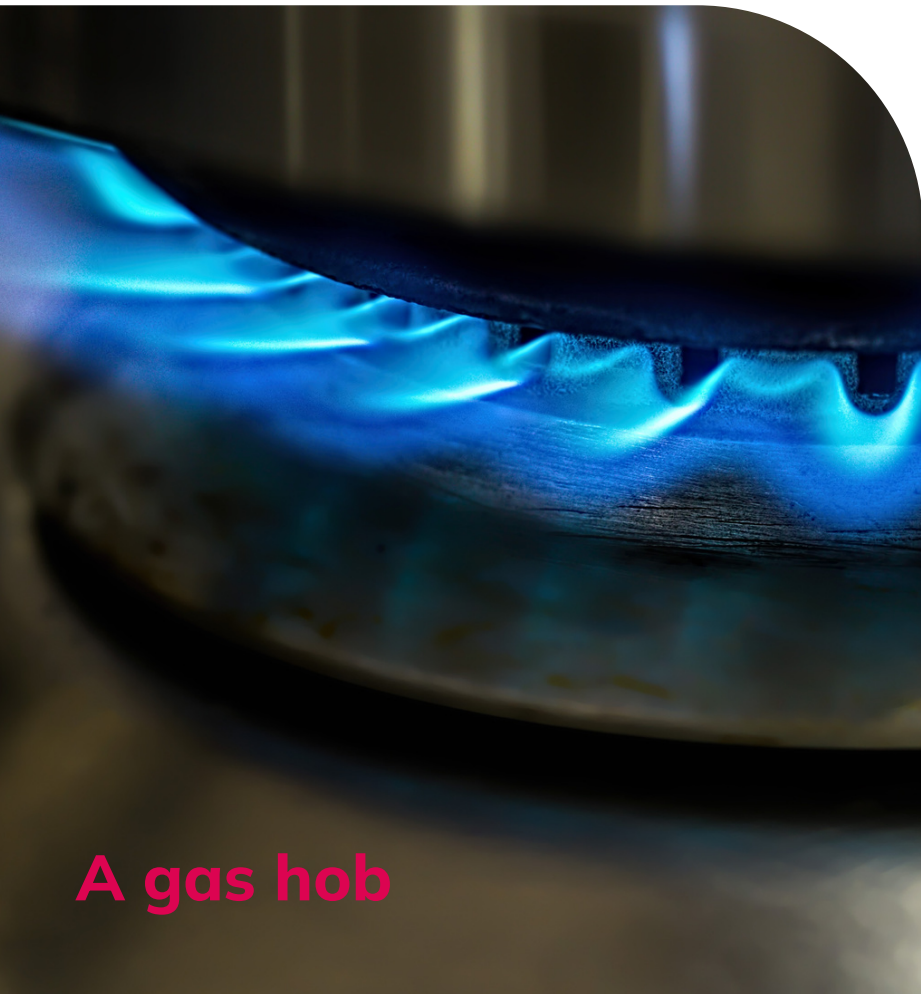
A gas hob