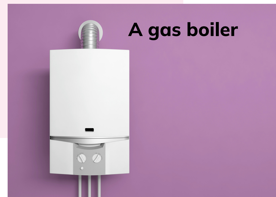
A gas boiler