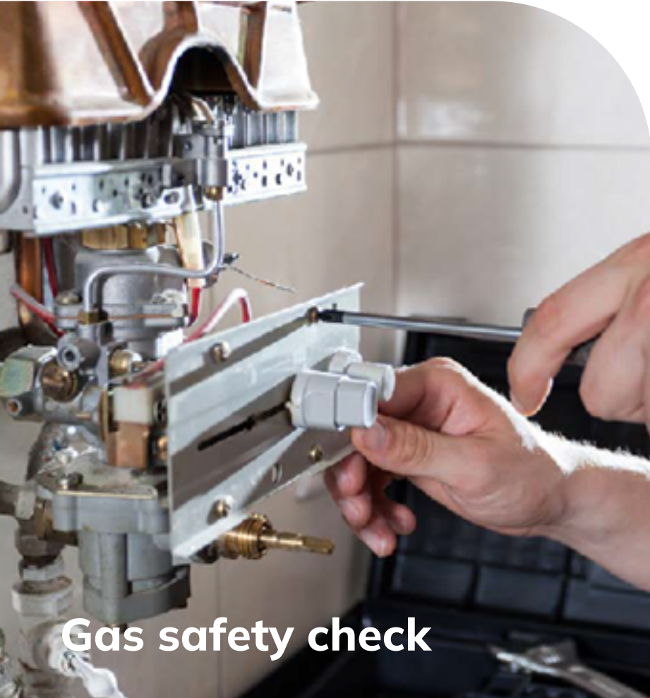
Gas safety check