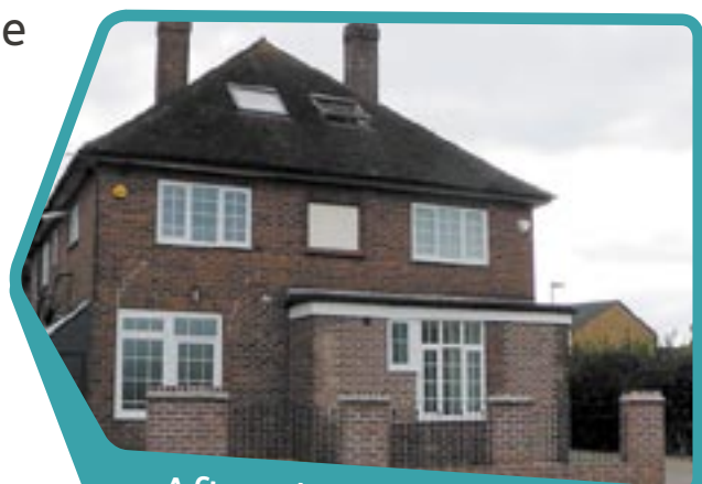
After the building works

Golden Lane Housing were able to go ahead with the project and worked very closely with the private landlord. The building works took 18 months to finish.